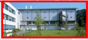
Zentrum für Halbleitertechnik und Optoelektronik